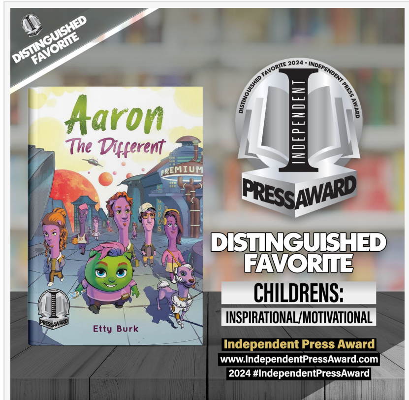
Award Banner for Aaron the Different: A Story of Courage, Belonging, and Acceptance