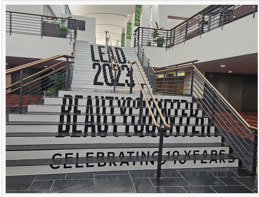
Beautycounter LEAD 2023 Experiential Stair Graphics

This award stemmed from the company's efforts in branding the event environment of Beautycounter's LEAD Conference at the Charlotte Convention Center in August 2023. LEAD is Beautycounter's annual leadership and training conference open to all Consultants, designed to take Beautycounter businesses and teams to the next level. Heritage executed the production and installation of eye-catching event graphics and displays that transformed the venue into a branded experience for the conference attendees, vendors, and key stakeholders.