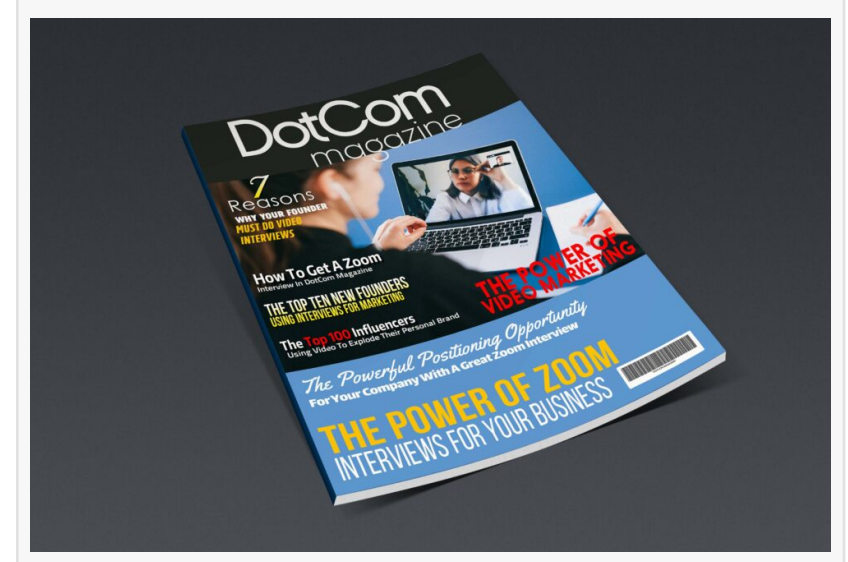
The DotCom Magazine Entrepreneur Spotlight Series Issue

This press release can be viewed online at: https://www.einpresswire.com/article/705633716