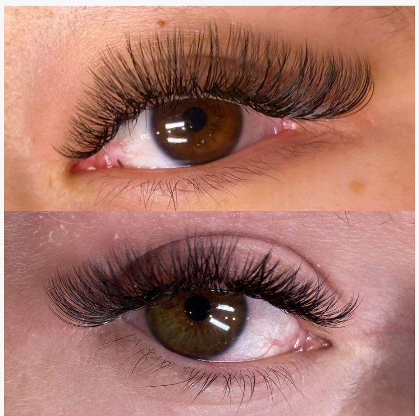
Lash Lift and Lash Tint

Velvet Lashes and Beauty's approach to customer service is centered on building lasting relationships with clients. Technicians take the time to understand clients' needs and provide personalized recommendations. This level of care ensures that clients leave the salon satisfied with their experience. The emphasis on quality and customer satisfaction has contributed to the salon's growing popularity in the