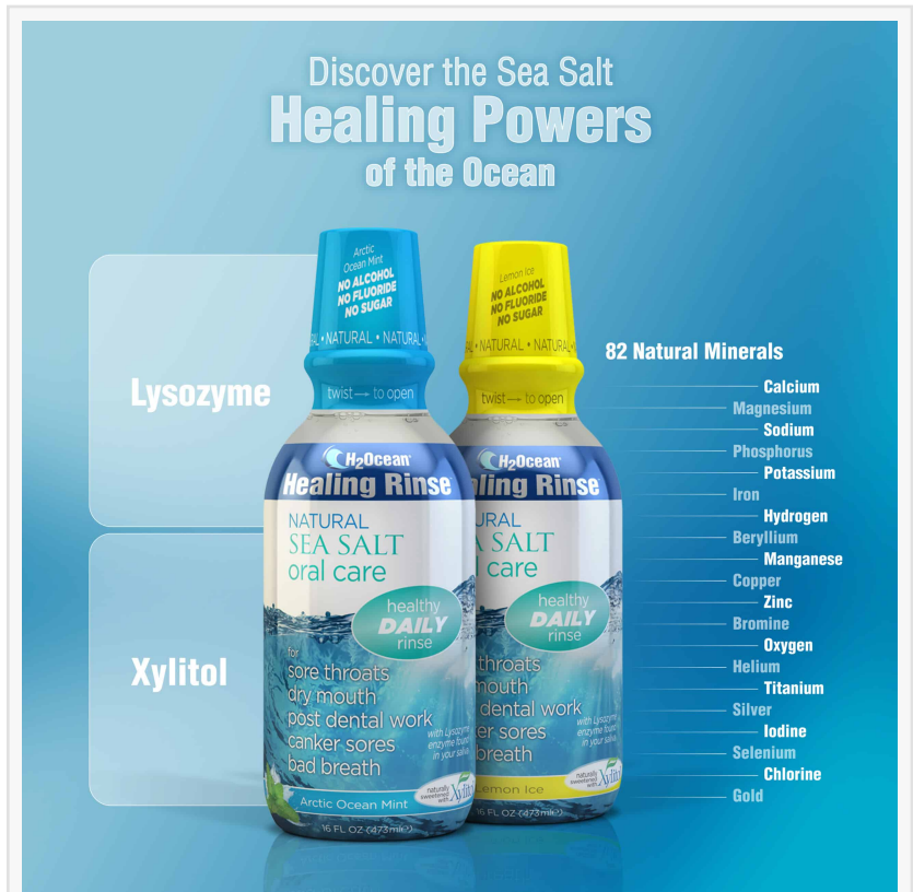
H2Ocean Sea Salt based Natural Oral Rinse

H2Ocean's oral care products offer countless oral health benefits, addressing dry mouth, bad breath, sore throat, canker sores, bleeding gums, sensitivity of teeth, teeth whitening, and immensely helping in healing after surgical procedures, including dental implants and orthodontics. H2Ocean continues to lead the way in natural oral care with a dedicated commitment to quality, sustainability, and harnessing nature's healing powers.