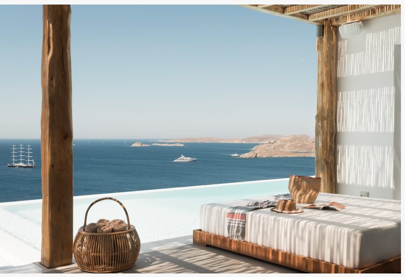
Multi-level terrace with infinity pool, spa, and custom loungers

"We are delighted to announce a remarkable milestone in the Greek luxury real estate market as 'Silk Shadow', a property of unparalleled elegance in Mykonos, will be auctioned through Sotheby's Concierge Auctions at Sotheby's London," said Savvas Savvaidis, President & CEO of Greece Sotheby's International Realty. "This marks the first time that a Greek luxury home of this caliber has been offered at a live auction event at Sotheby's. The villa itself is a jewel within the prestigious Agios Lazaros enclave, offering discerning buyers a unique opportunity to own more than just a home; it is an invitation to a lifestyle of luxury and exclusivity."