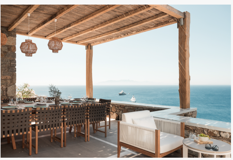
Pristine location in exclusive Agios Lazaros enclave of Mykonos

This opulent villa features designer ensuite bathrooms, all equipped with luxurious amenities such as steam showers and oversized tubs. The expansive living room and dining area afford panoramic views of the Aegean Sea, while a chef's kitchen and a state-of-the-art gym cater to guests' every need. Outdoors, a large infinity pool sparkles under the starlit sky, while a jacuzzi invites up to 10 guests to indulge in an indulgent soak. Custom sunbeds and loungers offer endless relaxation amid the warm Mediterranean sun, while the villa's unique location provides shelter from the renowned Mykonian winds.