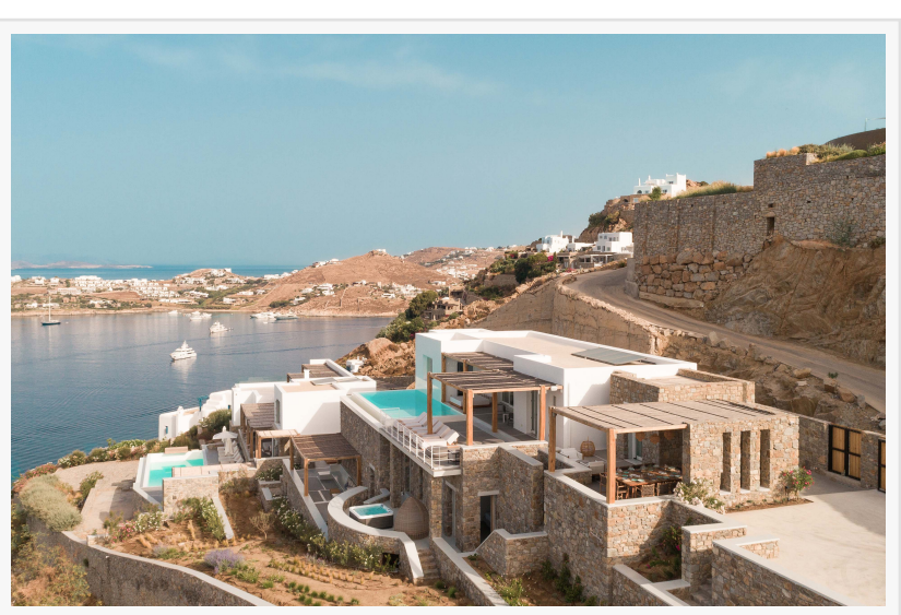
Contemporary villa that pays homage to traditional aesthetic

NEW YORK, NEW YORK, UNITED STATES, April 23, 2024 /EINPresswire.com/ -- A stunning cliffside villa, known as '<u>Silk Shadow</u>,' in the ultra-luxurious Agios Lazaros enclave of Mykonos is scheduled to hit the auction stage next month via <u>Sotheby's Concierge Auctions</u> in partnership with Greece Sotheby's International Realty. Bidding for the seven-bedroom retreat will commence