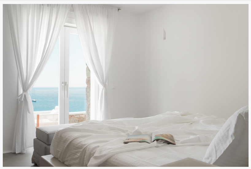
Panoramic Aegean Sea views

Images of the property can be viewed at conciergeauctions.com.