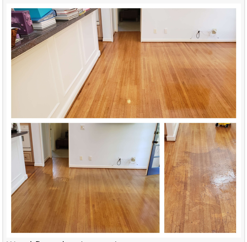
Wood floor cleaning services

Comprehensive Wood Floor Cleaning Services: Deep Cleaning for Lasting Impressions For homeowners with demanding schedules or those seeking a comprehensive cleaning