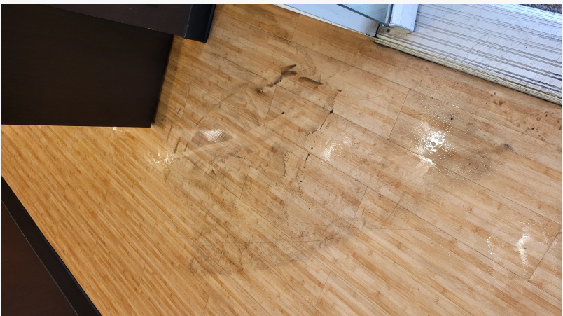
cleaning wood floors

Our knowledgeable team is dedicated to ensuring that each floor we treat is meticulously cared for, guaranteeing satisfaction and the enduring beauty of the wooden floors.