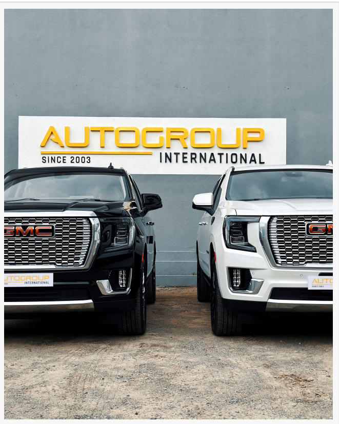
Right-hand drive 2024 GMC Yukon Denali by Autogroup International

Backed by Autogroup International's three decades of experience in the right-hand drive conversion business with a pedigree that includes over 4500 vehicles safely and legally converted to the highest possible quality standards and supported by a worldwide 3-year warranty and incountry service specialists.