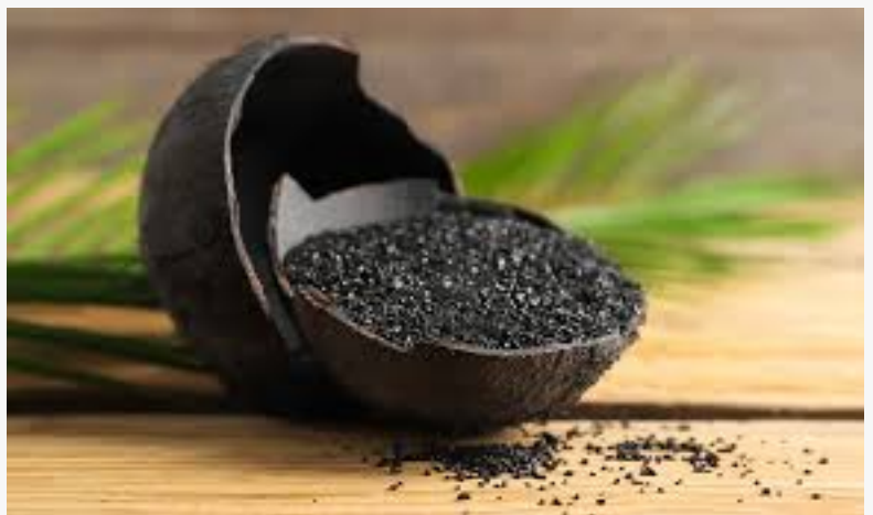
Activated Carbon Industry

The Latest Research report on “global Activated Carbon Market Report 2023 –