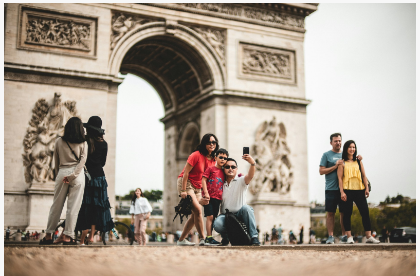
Paris is an all-time favourite, but now it's even more popular