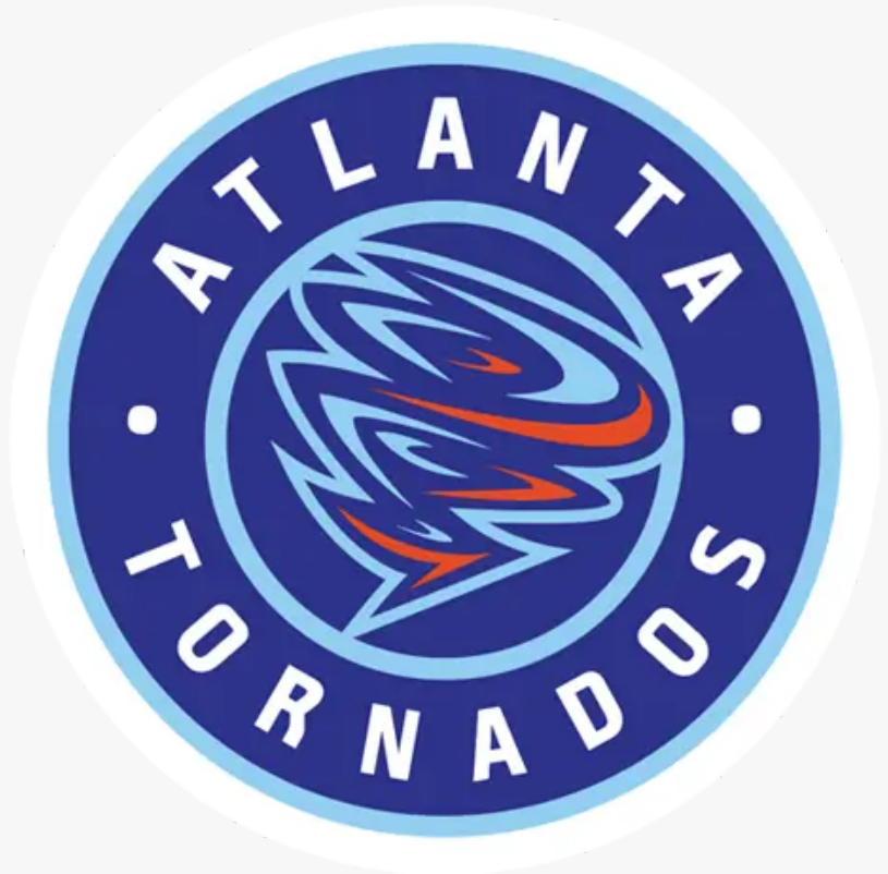
Atlanta Tornados are set to play the Derby City Colts on 4/27/24