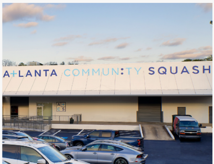
A+ Squash in Atlanta Georgia is the official home court of the Atlanta Tornados National Team