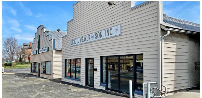
511 & 515 N. Main St., Culpeper, VA 22701