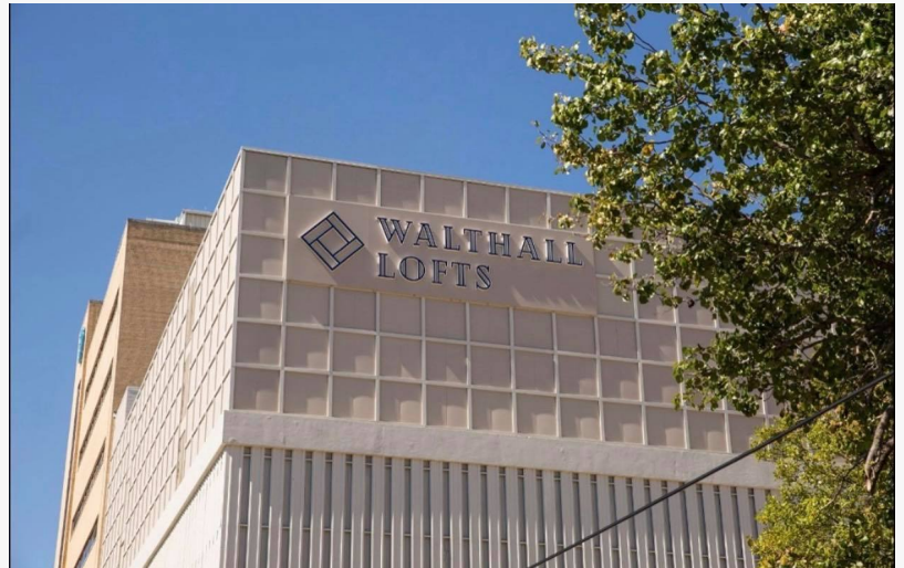
StateStreet Group Now Managing Walthall Lofts

JACKSON, MISSISSIPPI, UNITED STATES, April 23, 2024 /EINPresswire.com/ -- StateStreet Group, L.L.C. (SSG), an award-winning leader in property management, is delighted to announce its latest partnership, taking over the management of The Walthall Lofts and The Courthouse, premier apartment communities located in the heart of downtown Jackson, Mississippi. These additions to SSG's growing portfolio underlines the company's commitment to enhancing residential experiences and community development across the region.