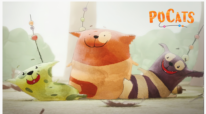
poCats by Ionart Studios