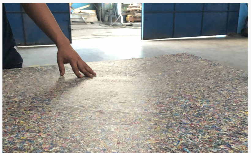
Plastic boards are versatile material, replacing plywood in many instances.

HELSINKI, SUOMI, April 23, 2024 /EINPresswire.com/ -- RiverRecycle, the largest company in the world to tackle plastic pollution in rivers, has now opened its facilities in the Philippines and Ghana for mechanical recycling and started the land-based collection. With this, RiverRecycle has entered the “full circle” phase of its operations. This pioneering system encompasses cleaning of floating plastic waste from the rivers, mechanical recycling of the collected plastic, and proactive land-based collection.