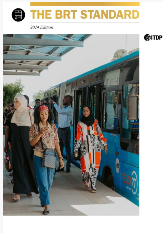
Cover of the 2024 Edition of the BRT Standard.