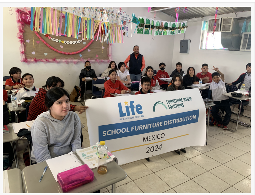
A photo of children in Baja California, Mexico, happily enjoying their new desks at school.