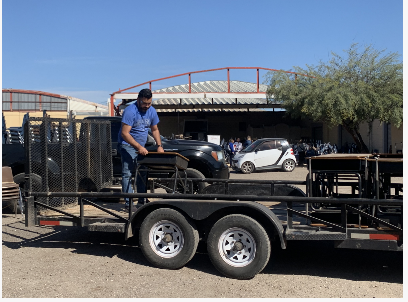
A photo of a LIFE team member unloading furniture.