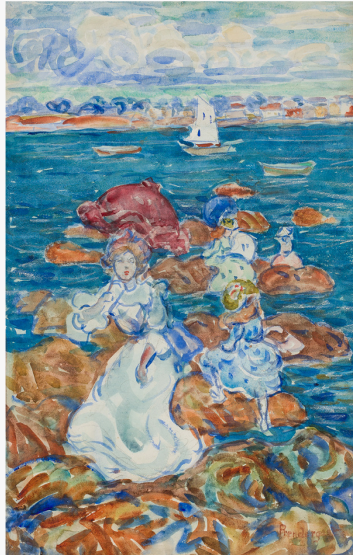
Watercolor and pencil on paper by Maurice Brazil Prendergast (Newfoundland/American, 1858-1924), titled Low Tide (1901), 20 ½ inches by 13 inches. Estimate: $80,000-$120,000.