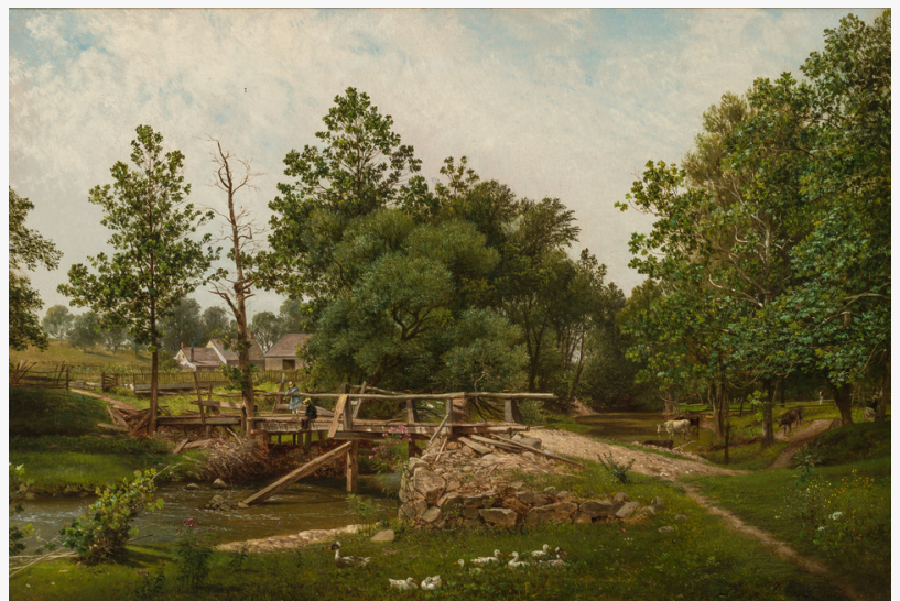
Oil on canvas by David Johnson (American, 1827-1908), titled Study from Nature, Warwick, New York (1873), 18 inches by 26 inches. Estimate: $40,000-$60,000.

This press release can be viewed online at: https://www.einpresswire.com/article/706031997