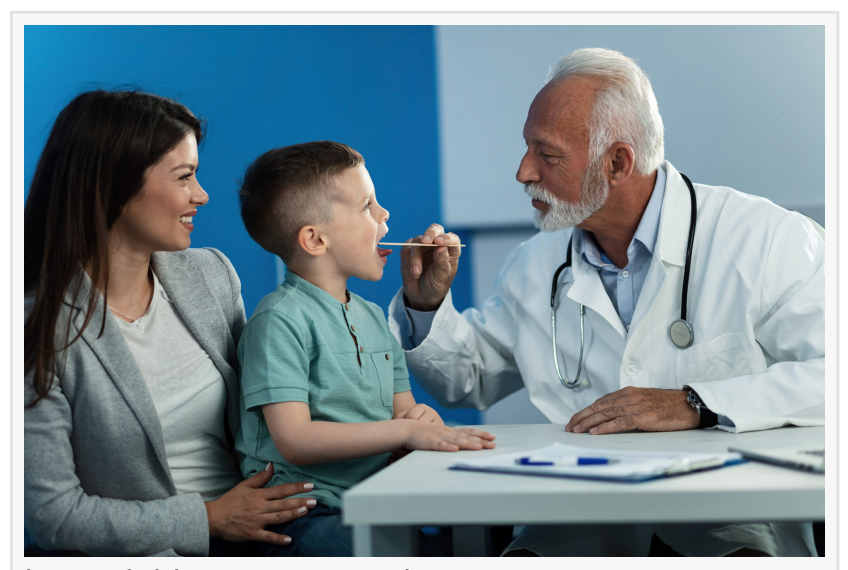
best Children ENT Specialist

It can make life extremely difficult if notice problems beginning in the nose, which is an essential organ of one's sinuses and respiratory system. This is why Ear, Nose, and Throat Doctor uses various therapies to ensure breathe correctly and don't get repeated sinus