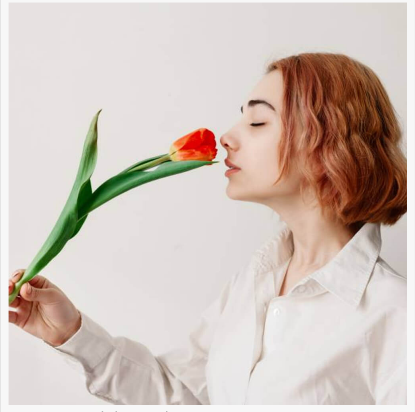
Ear nose and throat doctor