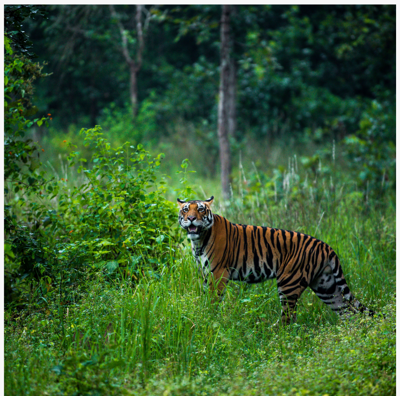
Pench National Park - Tiger sighting

This press release can be viewed online at: https://www.einpresswire.com/article/706154999