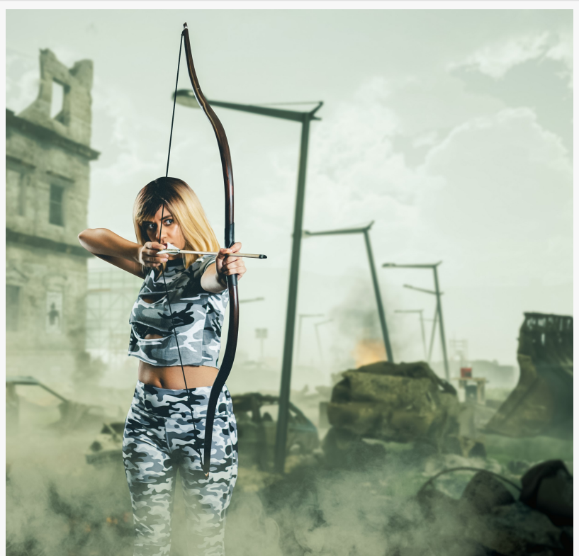
Challenging the dominance of Femthesim

into characters new and old... Overall, this is a brilliant end to a trilogy that has come a long way, and I am so glad I kept reading. Very highly recommended... I will be interested to see what author, Sean Williams comes out with next. If it's anything like The Last Man, it will certainly be