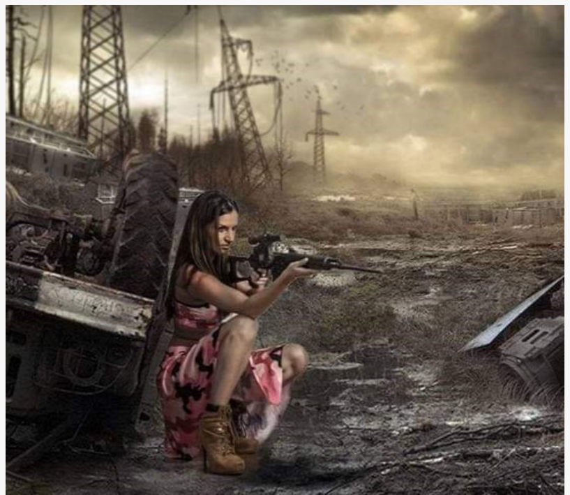
The Rise of the Pink Army