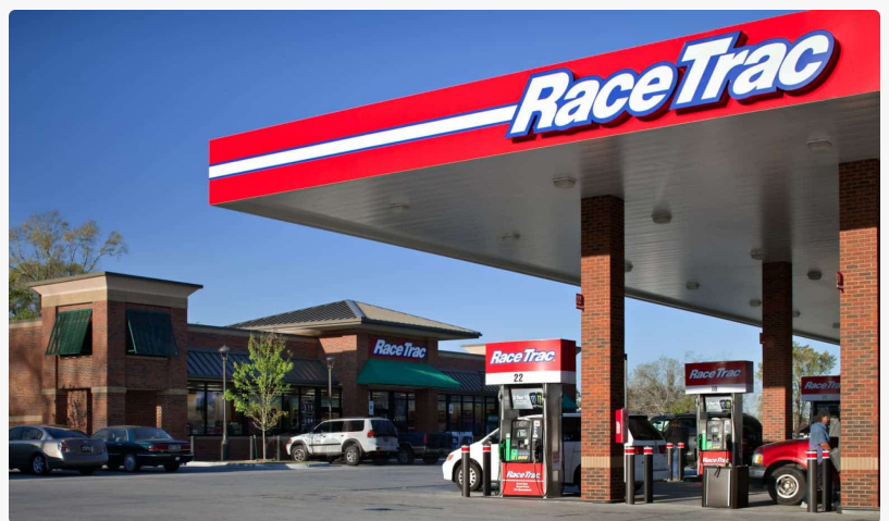
One of 580 RaceTrac site that have be retrofitted with Disruptive Technologies temperature monitoring solution.

ATLANTA, GEORGIA, USA, April 26, 2024 /EINPresswire.com/ -- RaceTrac, a leading convenience store chain and the 18th largest private company in the U.S. has successfully deployed a cutting-edge automated temperature monitoring solution from Disruptive Technologies across its 580 locations. This landmark project underscores RaceTrac's ongoing commitment to providing its guests with safe and fresh food while significantly increasing operational efficiency. At the same time, the partnership solidifies Disruptive Technologies' position as the definitive leader in large-scale, remote temperature monitoring rollouts.