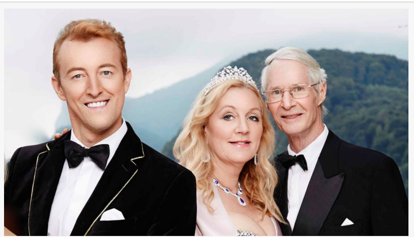
Princely family Prince Mario-Max, Prince Waldemar and Princess Antonia.

One of the greatest strengths of audiobooks is their convenience. Unlike traditional books, they can be enjoyed almost anywhere, anytime. A long commute becomes an opportunity to delve into a captivating novel, while a mundane task like folding laundry can be transformed into an engaging adventure. Audiobooks are the perfect companions for busy schedules, allowing us to squeeze in bits of literature throughout the day.