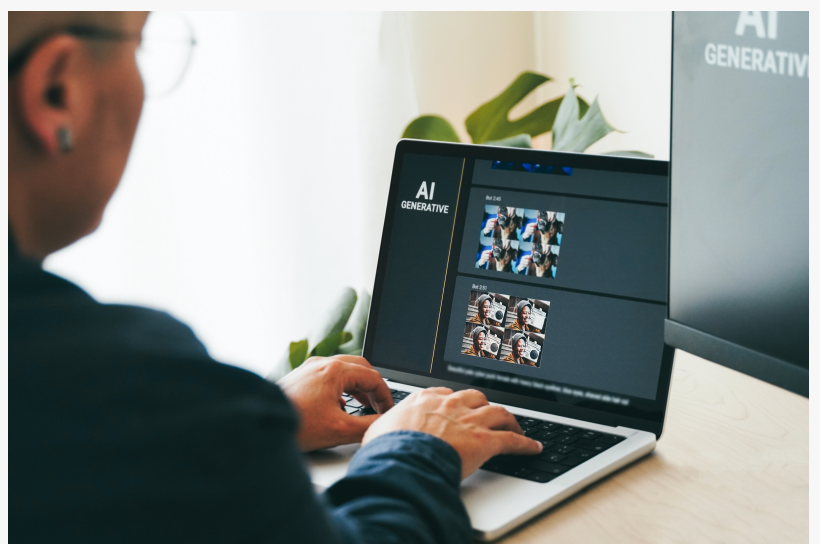
Human Led Human Resources - Not AI

This press release can be viewed online at: https://www.einpresswire.com/article/706236029