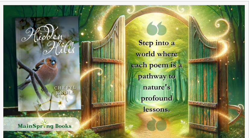
Hidden Hills