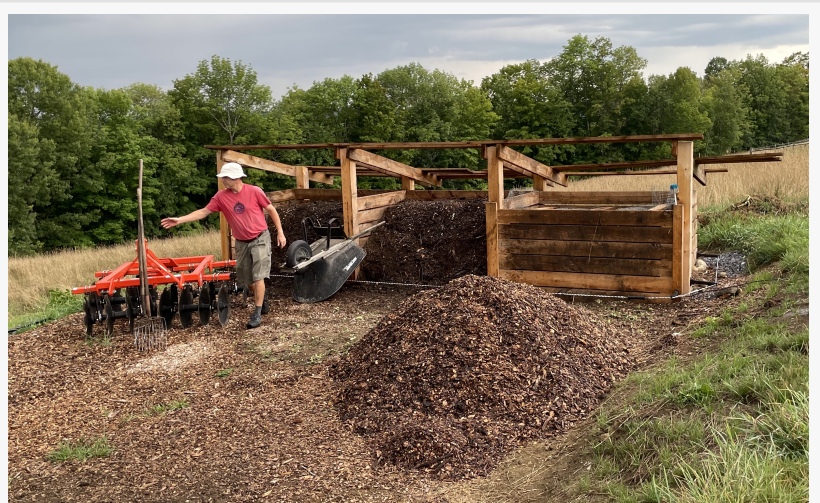
3-bin compost system, Firefly Farm at Burke hollow in Vermont

CAV is proud to announce the successful completion of its project, On-Farm Community-Scale Food Scrap and Agricultural Organic Waste Management in Vermont and New Hampshire. Through this project, we collaborated with farmer partners from seven small, diversified farms to establish compost operations and offer food scrap collection opportunities in their communities. The results were impressive, with our farmer partners composting an estimated 153 tons of food scraps and crop residues, 48 tons of manure (with bedding), and 33 tons of mixed carbon sources (leaves, hay, wood shavings). This led to the production of over 10 tons of finished compost, a testament to the effectiveness of on-farm community-oriented composting.