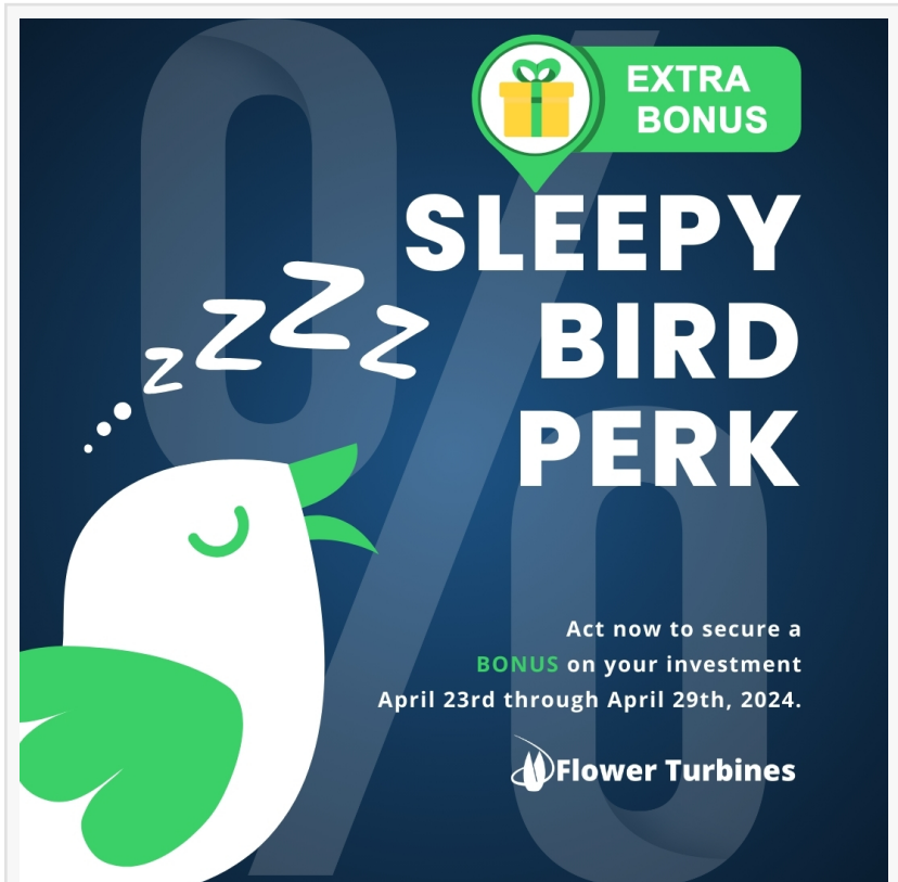
Mid-campaign Sleepy Bird Perk

One of the disruptive innovations in the Flower Turbines business plan is to change the market for small wind turbines from one at a time sales to large project sales. As an example, 4 turbines correctly arranged perform as