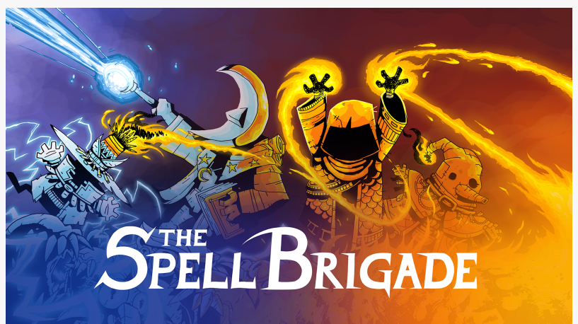
Logo - The Spell Brigade

“We’ve learned a lot during the development of our last game. One of the things we would love to do more is involve the community and ask for their feedback. We really value their input and love working with them to refine the game during