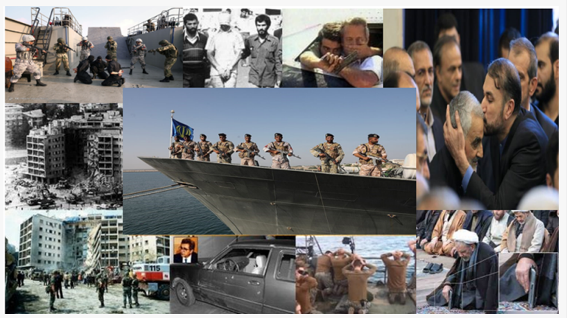
The Iranian regime's survival is dependent on two critical pillars: suppression at home, and spreading terrorism and warmongering abroad. The regime's Middle East strategy revolves around the concept of "strategic depth," which involves fostering regional influence.

The prevailing belief that standing firm against Tehran's aggressions may inevitably lead to war is a misconception by the Iranian regime itself. Tehran's lobbies in the West contend that other states have to "deal" with the regime instead of alienating it.