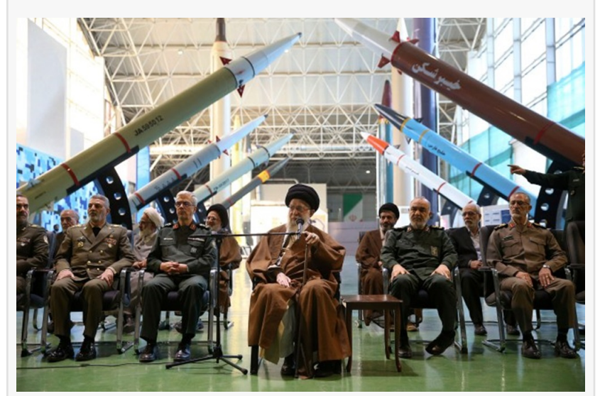
The regime's objective through its malevolent activities in the regions is discernible in various statements made by its officials. Ali Khamenei has emphasized, "If we do not engage in Syria, we may face battles in Kermanshah, Hamadan, and other Iranian provinces."

Commander of the Islamic Revolutionary Guards Corps (IRGC), Salami, emphasizes the regime's strategy, stating, "Syria and Iraq constitute the strategic depth of our defense, and the optimal approach in conflict with the enemy is to maintain distance."