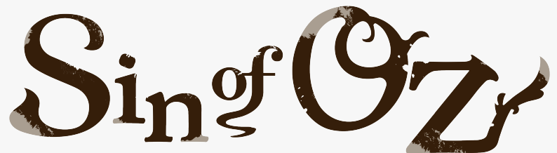
Sin of OZ Logo