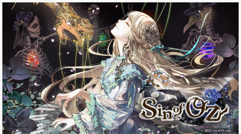
Sin of OZ

"Sin of OZ" is a simple-to-play mobile puzzle game with a dark fairytale-like story. Set in a world inspired by The Wizard of Oz, players take on the role of the Wonderful Wizard himself, who travels with his plush toy and doll friends through a land made dull and colorless by the witches' power. Many adventures await along the way, and the story advances as you progress through the puzzles. New stages and stories will be added over time. --Dive into this world and try to solve its