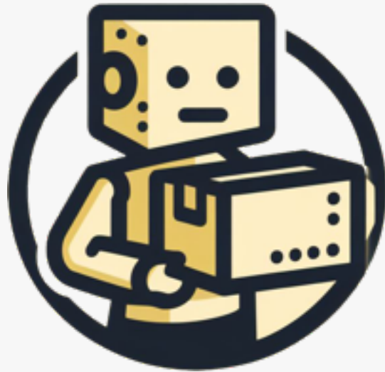
Executor Estate Sales

Executor's user-friendly online tool guides users through a series of simple questions about the estate. Based on this information, the tool generates a preliminary estimate of the total sale proceeds. This estimate serves as a valuable starting point for families as they consider their estate settlement options.