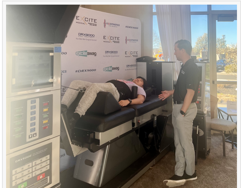
Excite Medical exhibits the DRX9000 Lumbar Spinal Decompression Machine and the DRX9000C Cervical Spinal Decompression Machine in Columbus, Oh.

COLUMBUS, OH, UNITED STATES, April 25, 2024 /EINPresswire.com/ -- Excite Medical proudly showcased its revolutionary DRX9000 at the OPTA Spring Conference, hosted by the Ohio Physical Therapy Association . As a leader in non-surgical spinal decompression technology, Excite Medical has been at the forefront of advancing drug-free and non-surgical treatment options for spinal conditions, such as the DRX9000 Spinal Decompression Machine .