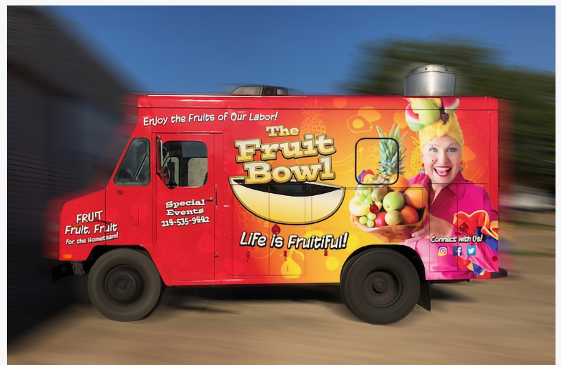
Awesome bright colors on Fruitbowl food truck wraps in Dallas TX