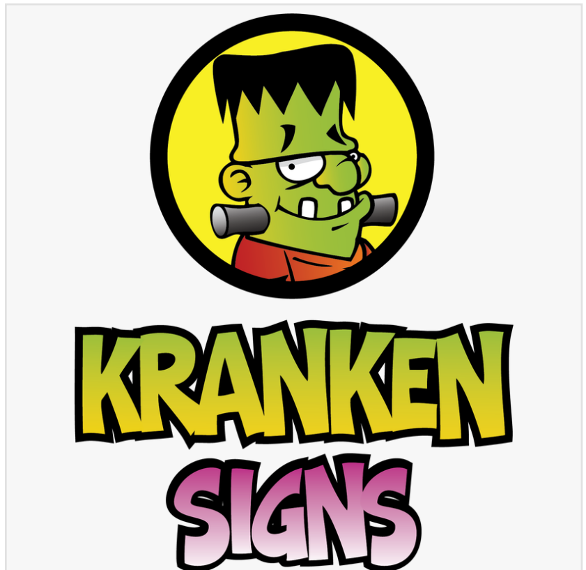
Dallas Vehicle Wraps

The new wrap for The Fruit Bowl food truck features a colorful and playful design that incorporates images of fresh fruits and a bold font that spells out the name of the business. The wrap also includes the truck's contact information and social media handles,