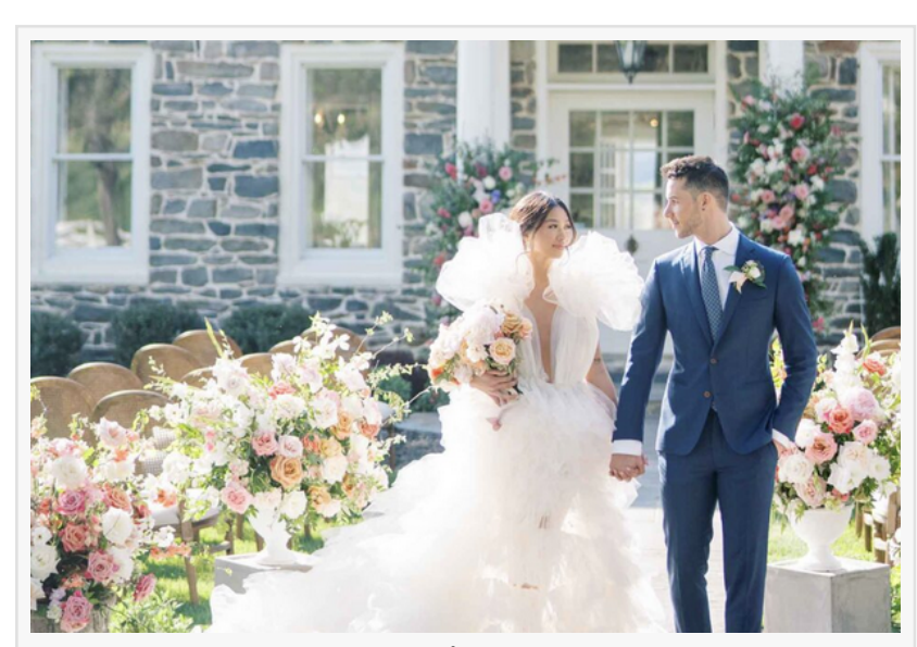
European Romance, British couture gown

CHARLOTTESVILLE, VA, USA, April 25, 2024 /EINPresswire.com/ -- Virginia Wine & Country Weddings, the premiere publication celebrating the elegance and allure of weddings in Virginia Wine Country, proudly announces the unveiling of their prestigious Real and Styled Weddings of the Year. A common wedding trend this year was for a bride to wear two or more outfits over the day, changing