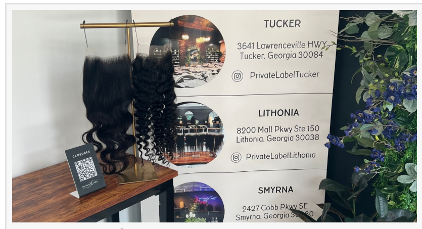
6x6 HD Lace Closures