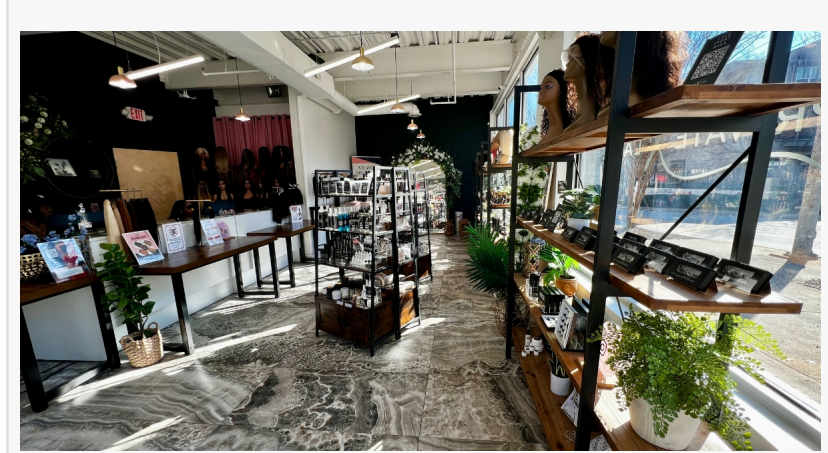
Atlanta Hair Store

extension fans to promptly receive their quality bundles, wigs, and lace products. Introducing 6x6 HD closures is the next step in catering to Atlanta's vibrant hair market. A 6x6 HD closure gives weave-wearers the feeling of a full lace without having to be glued down between one's ears, ensuring healthier edges. HD lace is thinner, allowing for a more seamless blend no matter the wearer's skin tone. The ease of installation means less commitment to the wearer, and the allotted spacing improves parting space. More parting space means more versatile styling options for hair extension lovers all over Atlanta.