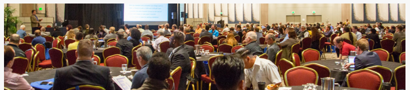
Annenberg Community Beach House