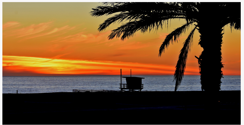
The Spectacular Setting for Summit XII

This press release can be viewed online at: https://www.einpresswire.com/article/706561409