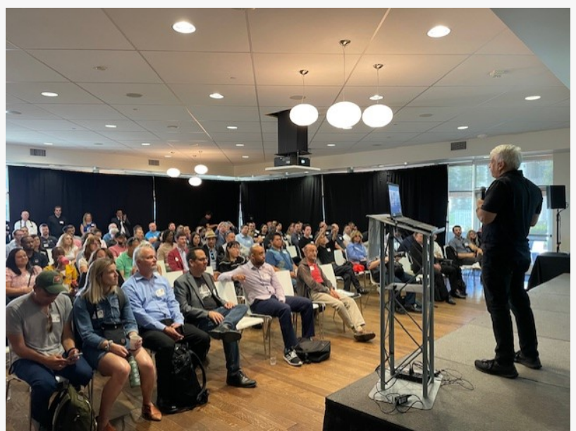
Cybersecurity and IT Leaders Are Engaged with Great Speakers