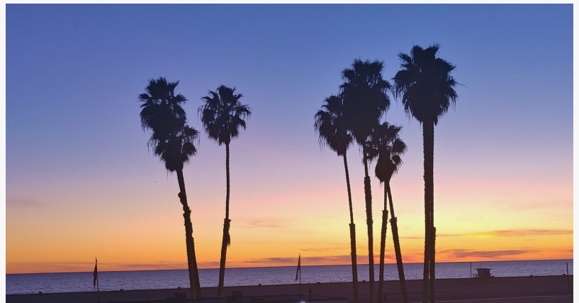
Right at the Beach