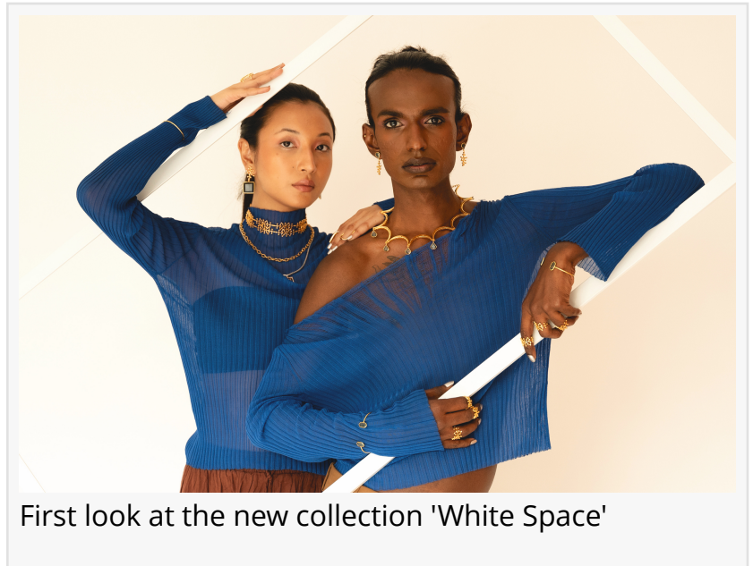
First look at the new collection 'White Space'

In tandem with the collection's launch, Dhvani Bansal Jewellery embarks on a new journey with its foray into the US market. Drawing upon its rich Indian heritage of craftsmanship and forward-thinking vision, the brand aims to forge robust connections and carve a niche among jewellery aficionados.