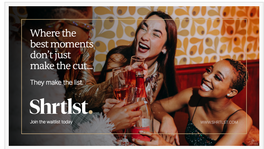
shrtlst lifestyle image

Shrtlst showcases a diverse array of A-Listers and is expanding into major cities, offering users exceptional, unbiased recommendations that create authentic experiences for travelers. The upcoming launch of the Shrtlst app will further elevate the experience, offering a user-friendly interface for effortless exploration and booking.