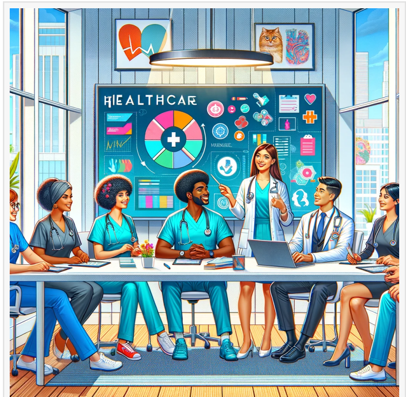
Nurse Practitioner Collaborating Physicians