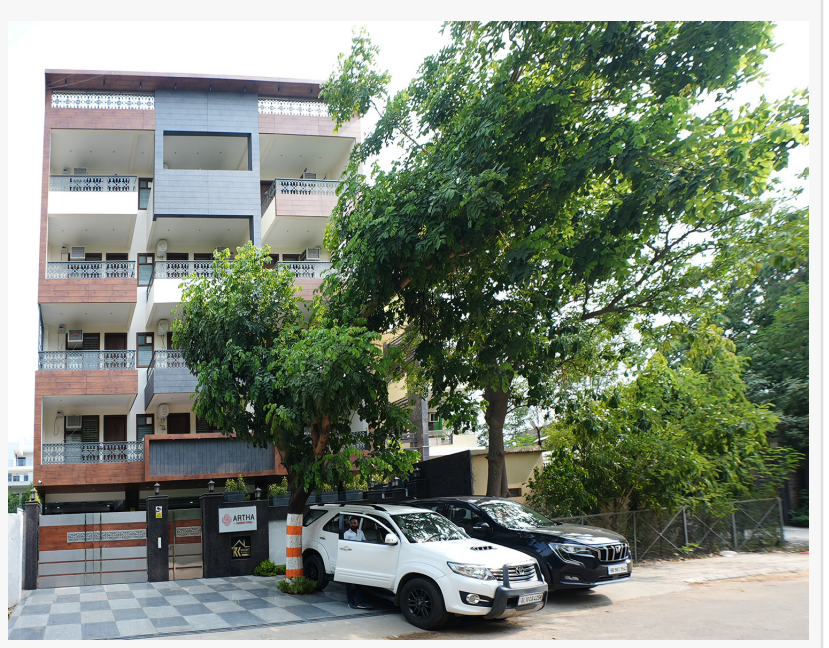
Artha Assisted living- independent and assisted living for senior citizens in Gurgaon

mobility and enhance physical health. The presence of hospital beds and round-the-clock monitoring underscore Artha's commitment to continuous care and vigilant oversight of each resident's health journey.