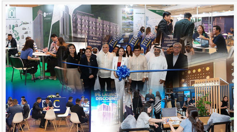
The 10th Philippine Property and Investment Exhibition (PPIE) will be held on May 11-12, 2024 at Bristol Hotel, Dubai

This year's annual event will take place at The Bristol Hotel, Deira, Dubai, aiming to spotlight the Philippines' robust economic performance, positioning the country as a premier investment hub in the Association of Southeast Asian Nations (ASEAN) region.