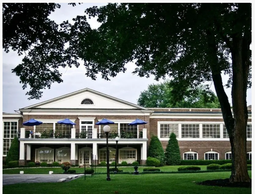
The Louisville Boat Club, Official Squash Courts for the National Squash League

UP NEXT FOR THE DERBY CITY COLTS On April 27th, the Derby City Colts are set to play the Atlanta Tornados in the Week 1 matchup in Atlanta, Georgia. However, if Derby City Colts fans do not want to travel to Georgia, they'll have the opportunity to see the Week 3 matchup against the Nashville Crushers on May 17th, which will be hosted in Louisville. Spectators can find match details like location and time on the Events page and visit the Buy Tickets tab to purchase their seat to see the Derby City Colts players in action.