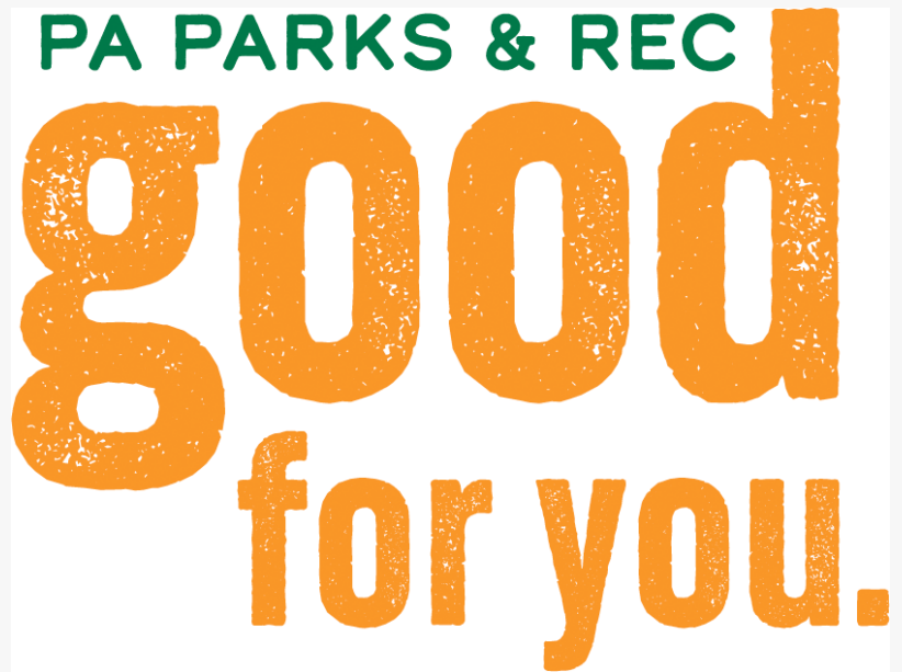
good for PA logo