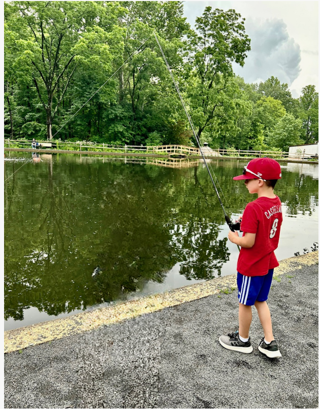
Fishing is one of 72 options searchable on the Park Finder

Good for You is an undertaking of the Pennsylvania Recreation and Park Society (PRPS) and the Pennsylvania Department of Conservation & Natural Resources to show the world all the