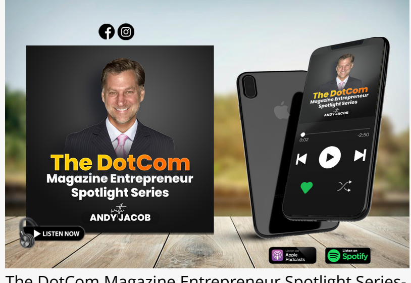
The DotCom Magazine Entrepreneur Spotlight Series-Cover Story