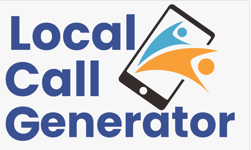
Local Call Generator