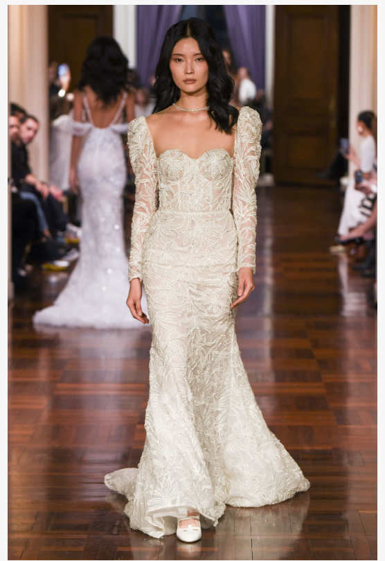
Impeccable pieces crafted from lab grown diamonds with zero compromise.

Revelation™ Lab Grown Diamonds Melissa@RevelationDiamonds.com https://revelation.co/