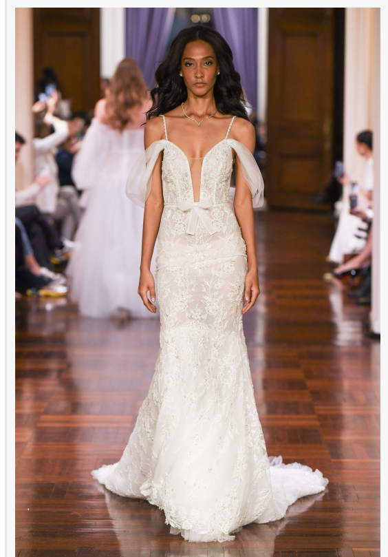
At Rêvelation™ we craft impeccable lab grown diamonds and jewelry

In an exclusive interview backstage, Cohen revealed his inspiration behind the choice of lab grown diamonds. "Modern brides are not only looking for exquisite beauty in their accessories but also want to make a positive impact with their choices," he explained. "By incorporating lab grown diamonds from Revelation™, I am not only showcasing stunning jewelry but also aligning