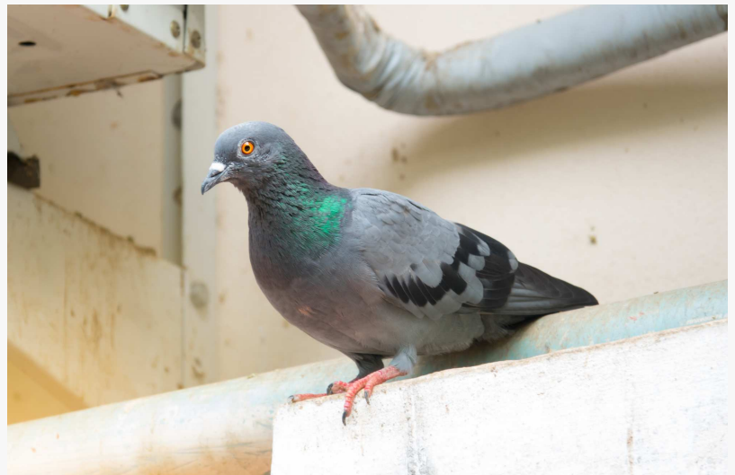
Commercial Bird Proofing