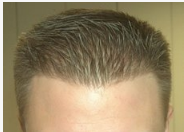
Natural Hairline HD Silicone