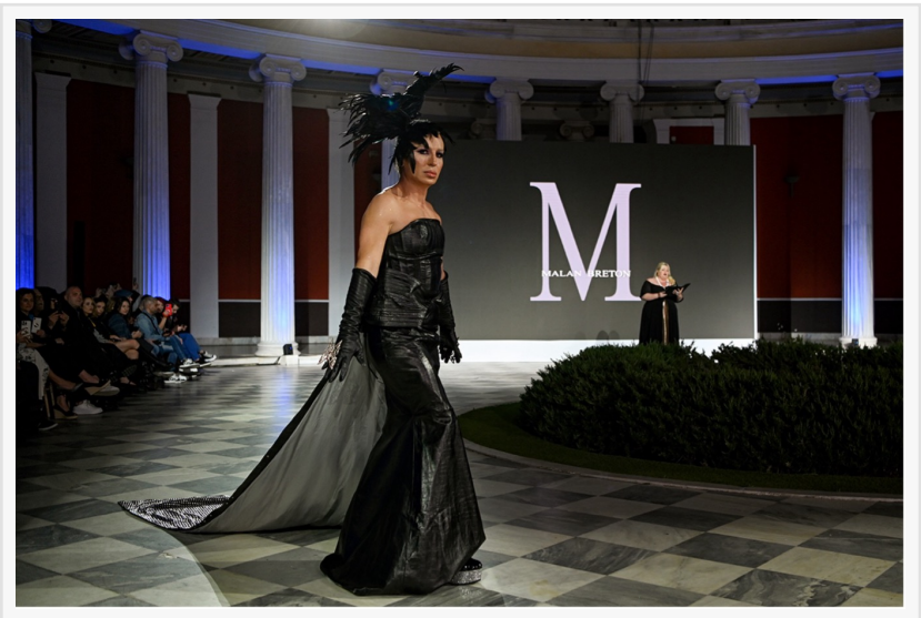
Elton Ilirjani

Known around the world as a highranking social media influencer and fashion model, Ilirjani boasts a breathtaking following of over 12 million fans. His legions of followers