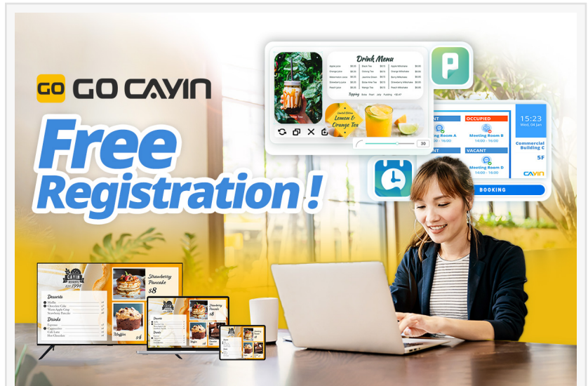
GO CAYIN - sign-up for free

One of the key advantages of GO CAYIN is its seamless integration with smart TVs and personal digital devices. Whether it's a tablet, mobile phone, or smart TV, users can easily access content from GO CAYIN by simply entering the URL, offering unparalleled convenience and accessibility. This seamless connectivity ensures that businesses can reach their target audience effectively